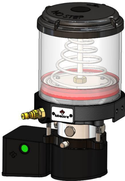
Figure 2 4kg Pump shown with 57.497 Reservoir

As a visual aid, a 4kg pump with a 57.497 reservoir is shown compared to a 4kg pump with a 58.497 below.