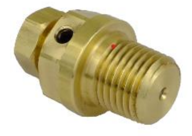
Figure 1: 54.354, current 200 BAR Pressure Relief Valve

Notice the generation marks all around the cap to indicate the improved version.