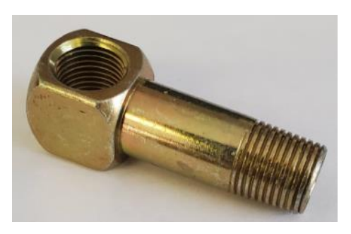
Figure 1 Current Yellow Zinc Plated Part Example

Lubecore is pleased to announce that steel fittings manufactured by Lubecore will now feature a zinc nickel sealed plating rather than the yellow zinc dichromate plating we have used for many years. Lubecore is making this change to increase the corrosion resistance of the fittings we manufacture. Although the yellow zinc plated parts have served us well, we are excited to make a product improvement that will serve us even better. To the right you can see an example of the plating you are familiar with receiving from Lubecore.