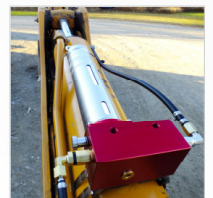
Integrated level check