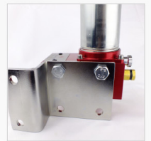
Heavy-duty stainless steel brackets